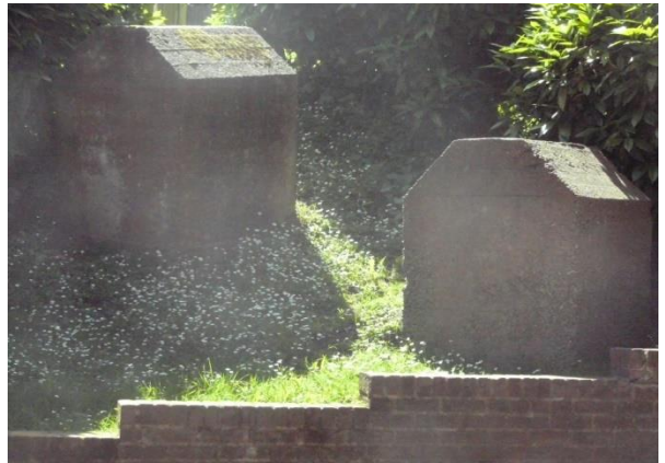
Dragons' Teeth' in front of St Mary's church hall

With as much buried below ground as appears above, these robust features were only subsequently removed where absolutely necessary such as where the High Street narrows near The Almonry or by subsequent development. Battle was designated a 'fortress' area, others being at Mountfield and at Cripps Corner where much survives today. In 1940 the area was defended by 45<sup>th</sup> Div., XII Corps, and Battle's fortress area lay on the Divisional Stop Line (a line intended to hold the enemy's advance). Occasionally the constructors left their mark in the wet concrete; Wills <sup>24</sup> states, 'At Battle, Sussex, the days' scores by the Royal Air Force in the Battle of Britain were recorded on some obstacles.'