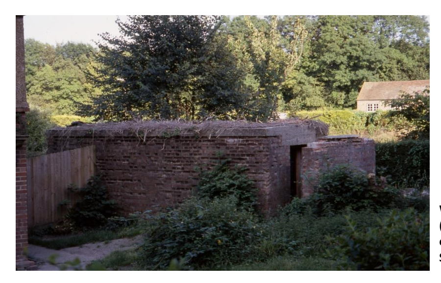
WWII Public air raid shelter (note blast wall to protect the entrance) in garden of 28 Senlac Gardens

Later in the war Battle took on the role of a garrison centre, on the edge of the militarised coastal zone, Canadians being predominant and based at Battle Abbey. The town was fortunate in escaping the frequent hit-and-run raids by fighters that plagued Hastings, Bexhill and Eastbourne. However there were precautions: a public air raid shelter was opened in the garden of 28 Senlac Gardens. There were also anti-aircraft batteries in a number of places.